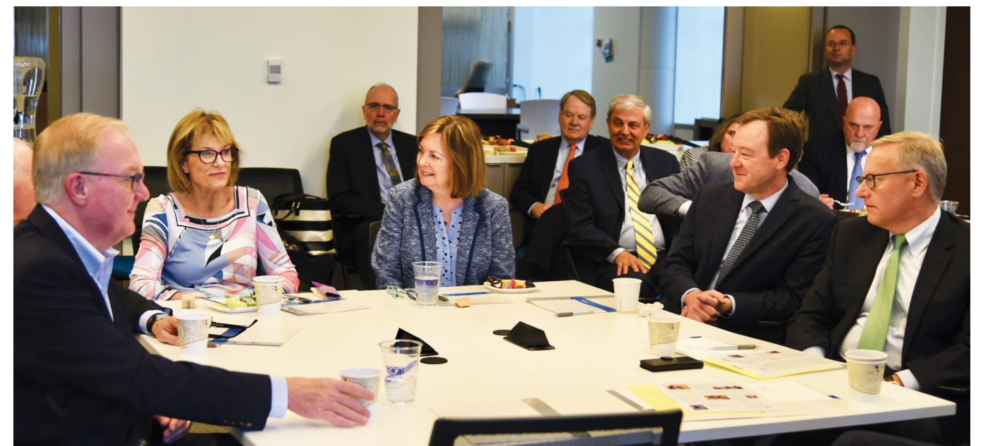
Roundtable members at 2019 Annual Meeting