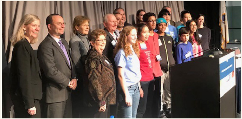
Participants celebrate the talented young Mathletes during the unique quiz show promoted by Dell Technologies and MATHCOUNTS