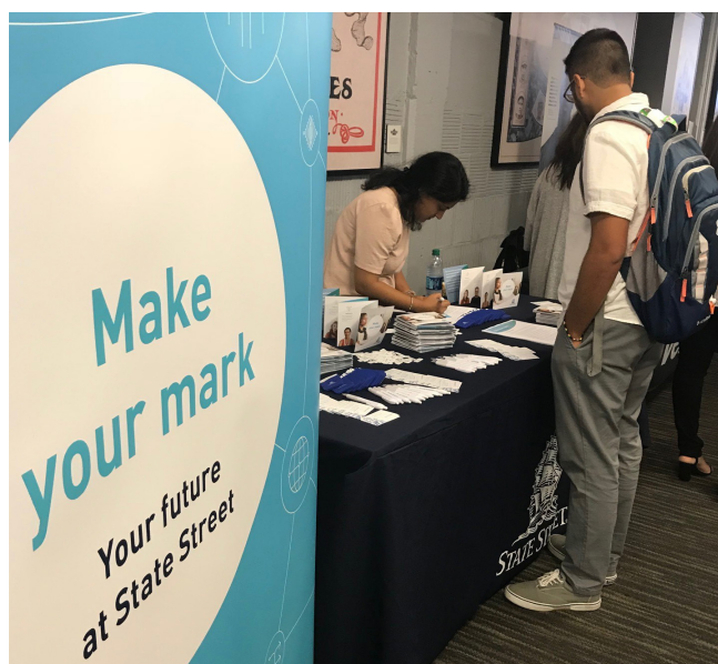
College students visit Roundtable member resource tables during STEM Career Fair

The Roundtable issued a letter detailing its strong support for Commonwealth Corporation's successful application for a $1 million Digital Innovation Grant to support workforce training. Commonwealth Corporation, which manages the Workforce Training Fund and Workforce Competitiveness Trust Fund, is a major workforce partner with the Roundtable and its members to ensure that Massachusetts continues to have the talented workers employers need.