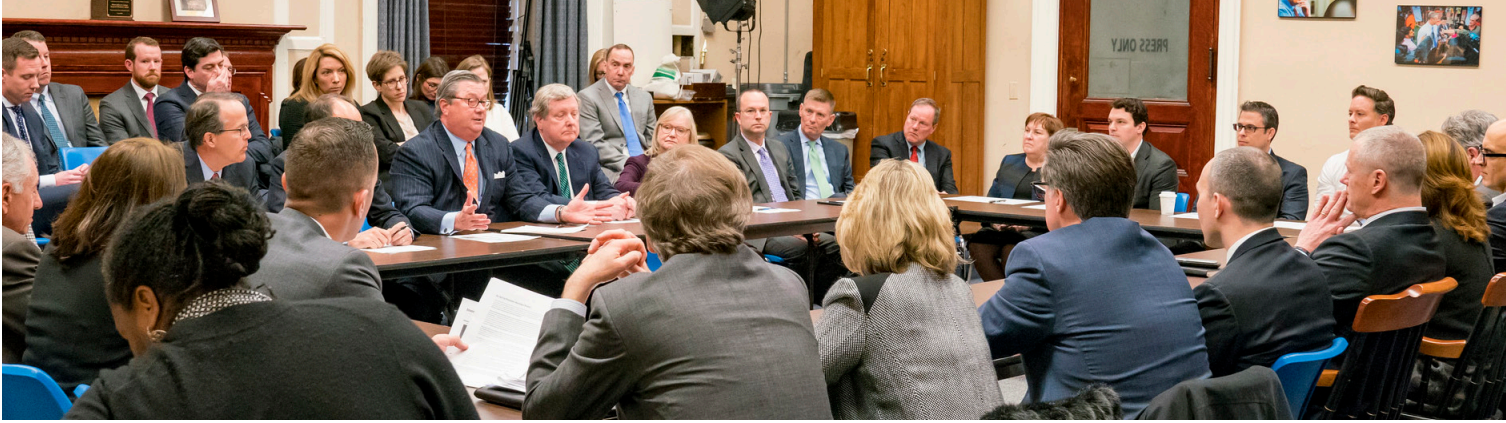
Governor Baker meets with business leaders to discuss Housing Choice Initiative