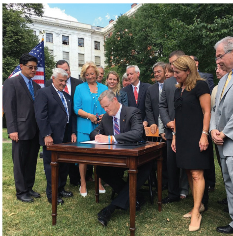
Governor Baker Signs Energy Legislation

The economic development legislation included key Roundtable priorities such as workforce development, regional economic development funding and support for educational institutions.