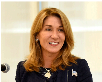
Lt. Governor Karyn Polito