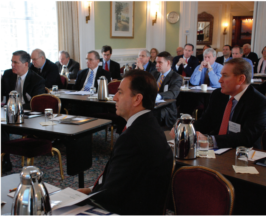
MBR Summit on State Fiscal Policy

retention, such as “reputation of the organization as a good employer,” the “organization’s reputation as a great place to work,” and the “organization’s reputation for social responsibility.”