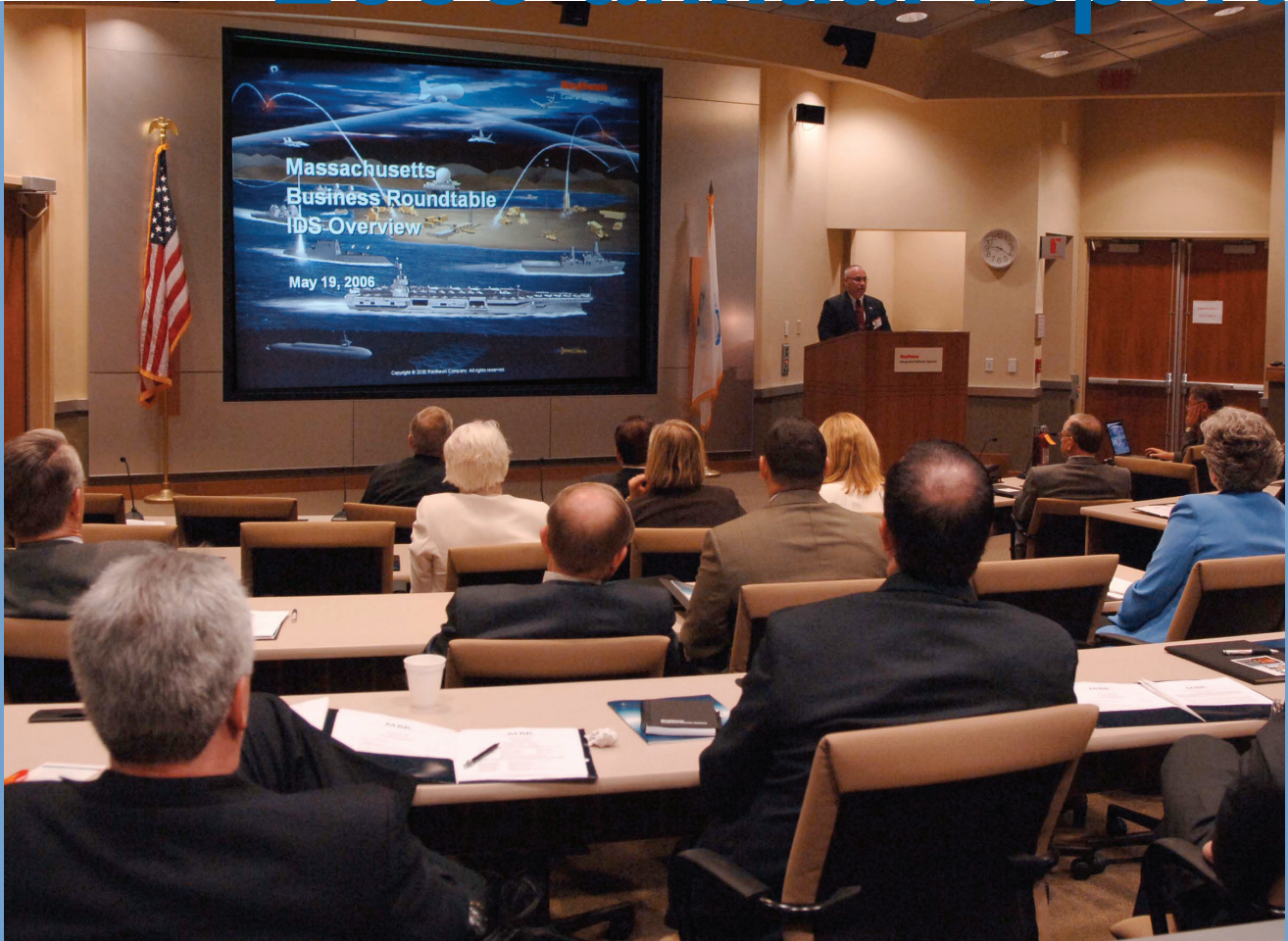
2006 MBR Annual Meeting—Raytheon Integrated Defense Systems, Tewksbury, MA